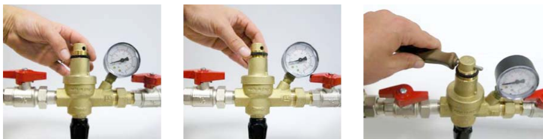
Fig. 1: Outlet pressure adjustment procedure.

Outlet pressure factory setting is 1.5 bar. Outlet pressure can be adjusted even after the unit has been installed. To modify pressure, loosen the black ring in plastic and turn the knob clockwise to increase the outlet pressure, or anti-clockwise to reduce it, as shown in Fig.1. The value can be read on the pressure gauge installed on the unit.