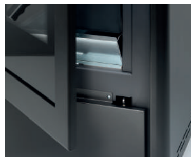
SAFETY SENSOR ON THE DOOR